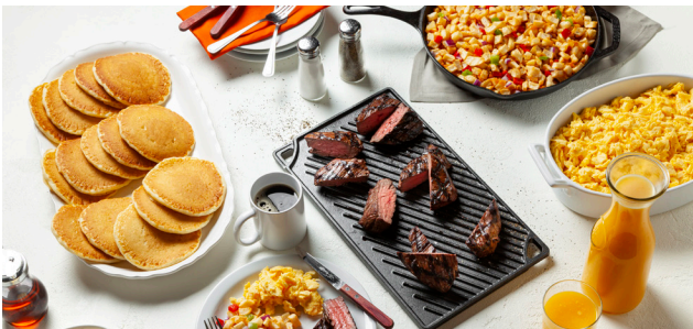
SIRLOIN STEAK & EGGS BREAKFAST COMBO | Tray - Serves 10 Sirloin Steak grilled medium, Scrambled Eggs, Home Fries and Hotcakes. Tray: $159.99 Individual Box: $16.99 each