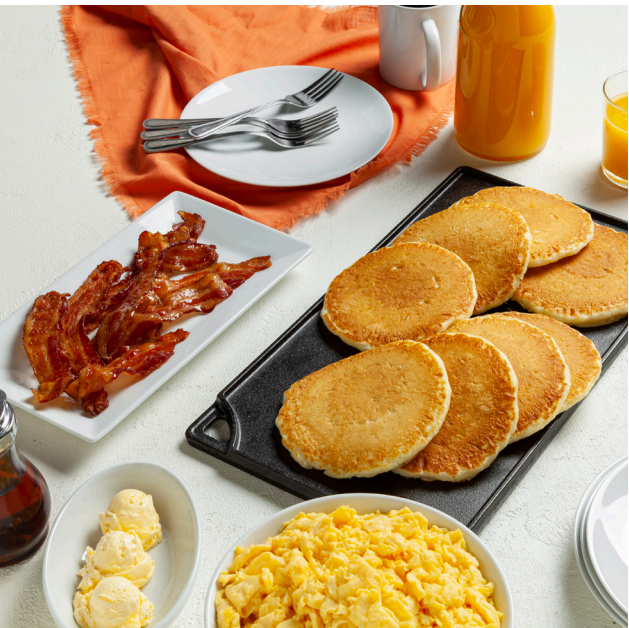
SOCAL BREAKFAST | Tray - Serves 10 Scrambled Eggs, Bacon or Sausage and Hotcakes. Tray: $119.99 Individual Box: $11.99 each