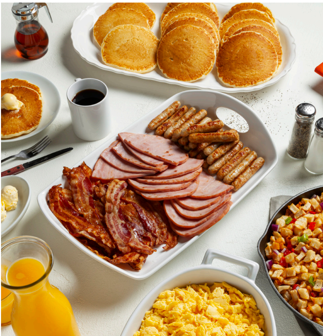
BIGGER BETTER BREAKFAST COMBO | Tray - Serves 10 Scrambled Eggs, Bacon, Ham, Sausage, Home Fries and Hotcakes. Tray: $134.99 Individual Box: $13.99 each