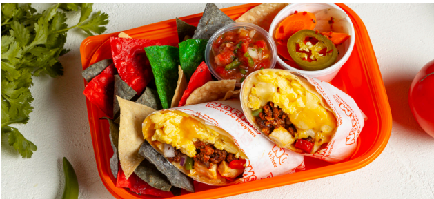
BREAKFAST BURRITOS | Tray - Serves 10 Choice of Bacon, Ham, Sausage, Chorizo or Vegetarian, with Peppers, Onions and Potatoes. Individually wrapped and cut in half. Served with Chips, Salsa and Escabeche. Tray: $119.99 Individual Box: $12.49 each