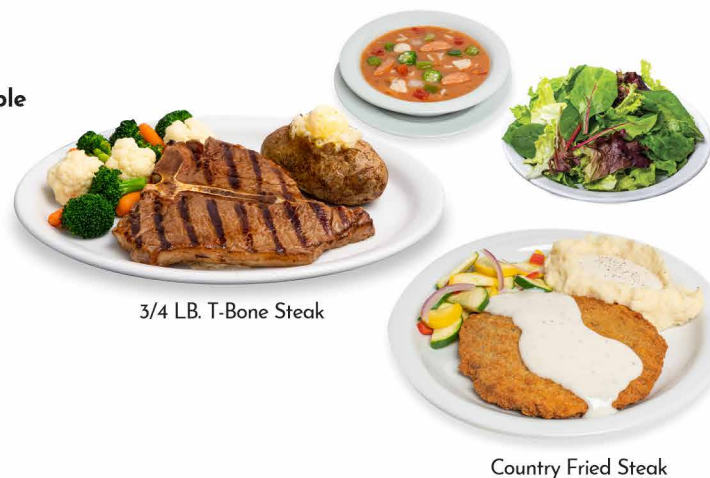
3/4 LB. T-Bone Steak

Fried Beef Steak and Country Gravy. Also available as 2 breaded Chicken Breasts.