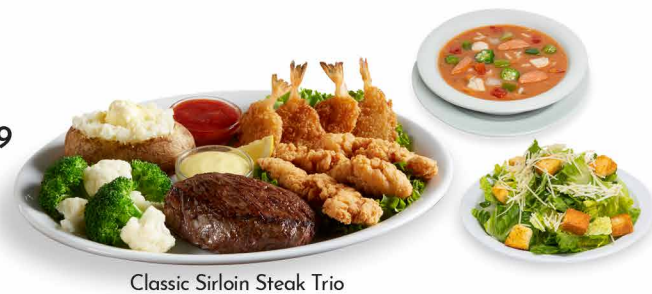
Classic Sirloin Steak Trio

6 oz. Sirloin Steak served with Fried Shrimp (4), Chicken Tenders (3), Honey Mustard Sauce, Cocktail Sauce & fresh Lemon.