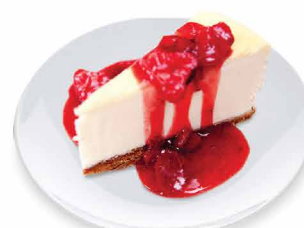
Classic Cheesecake topped with Strawberries

Ask your server for the current list of ice cream flavors!