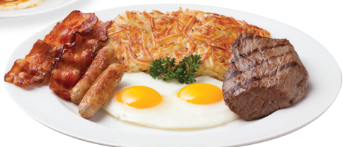
Sirloin Steak Bigger Better Breakfast

Sirloin Steak, 2 Bacon Strips, 2 Link Sausages, 2 Eggs, Hash Browns or Fruit. Choice of Toast or 2 Buttermilk Hotcakes.