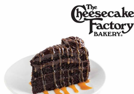
Chocolate Fudge Cake