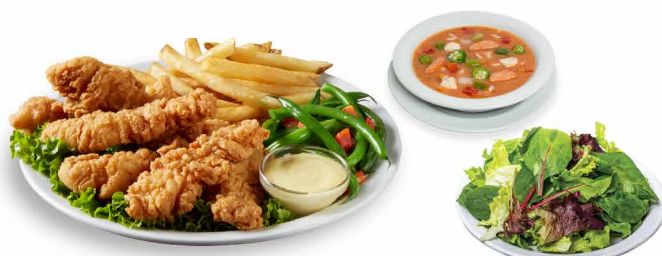
Southern Style Chicken Tenders

Chicken Tenders (6). Choice of Honey Mustard Sauce or Buffalo Style!