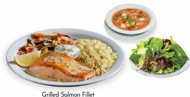
Grilled Salmon Fillet

Fried Shrimp (12), Cocktail Sauce & fresh Lemon.