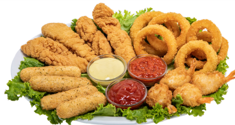
Chef's Sampler Platter

Fried Shrimp, Chicken Tenders, Mozzarella Cheese Sticks & Onion Rings served with 3 different sauces.