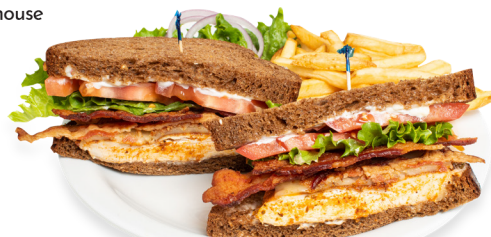
Cajun Chicken Sandwich

Tuna Salad & melted American Cheese on grilled Whole Wheat Bread.