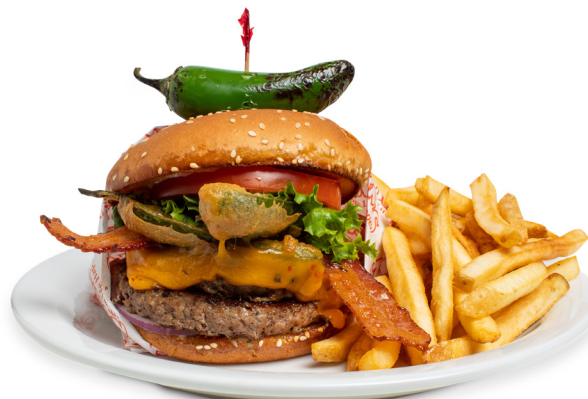
Habanero Jalapeño Bacon Cheeseburger

HABANERO JALAPEÑO BACON CHEESEBURGER* 1030-1090 CAL 15.99