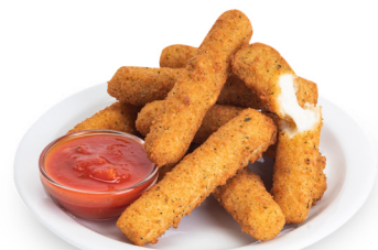
Mozzarella Cheese Sticks

Fried Chicken Tenders (6) with choice of Honey Mustard Sauce or Buffalo Style!